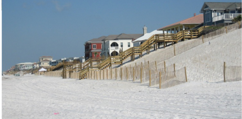
Before and After: A Florida beachfront so damaged by recent hurricanes that a Geotube<sup>®</sup> unit was needed to save homes, and (after) recreation following the installation of Geotube<sup>®</sup> geocontainment technology.

Geotube® geocontainment technology has been successfully used to protect some of the world's most expensive property. For example, erosion threatened Atlantic City's famous