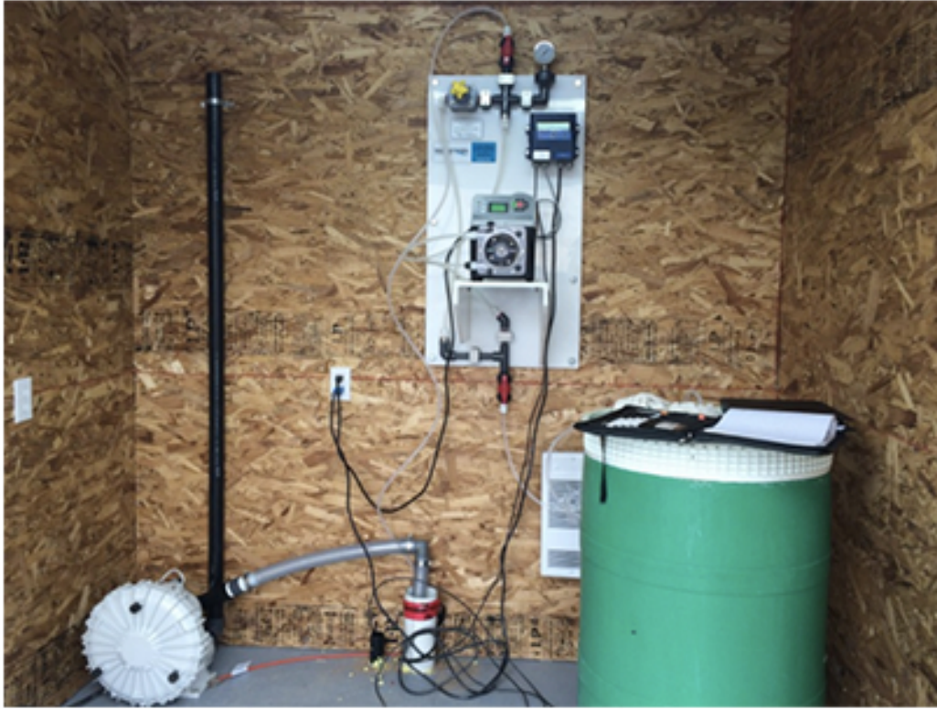
pH adjustment system and blower

After a period of acclimatization, the pH adjustment system was able to increase the pH from an average of 5.9 to 7.2, a level much more suitable for the development of treatment bacteria in the system. Initial concentrations of BOD range from 1300-1600 mg/L, and has been reduced to less than 400mg/L. These results are expected to improve as the amount of treatment bacteria increase on the BioCord.